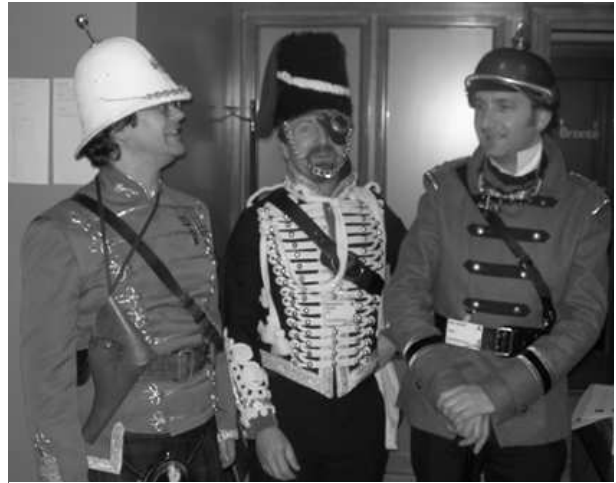
Three steampunk heros by Wilf